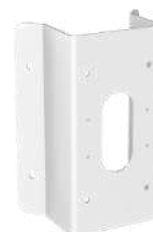
DS-1476ZJ-SUS Corner Mount