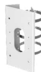
DS-1475ZJ-Y Vertical Pole Mount