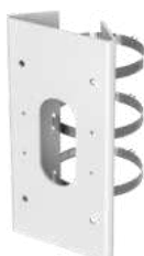
DS-1475ZJ-SUS Vertical Pole Mount