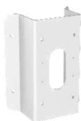
DS-1476ZJ-Y Corner Mount